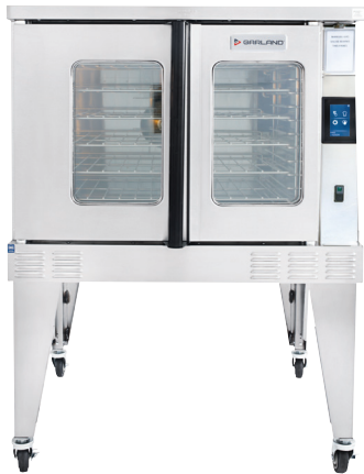
Model MCO-ES-10M Shown with optional casters