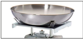
Optional spider and bowl assembly