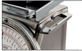
Optional carrying handle