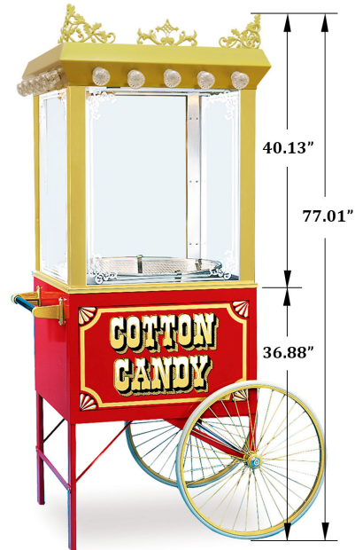
Cart shown with 3119 Unifloss Top and Floss Unit for reference only (items sold separately)