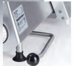
Side Lift arm, included