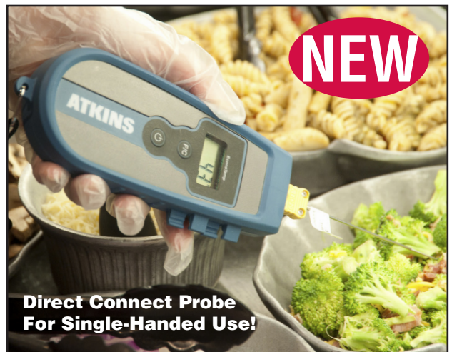
Direct Connect Probe For Single-Handed Use!