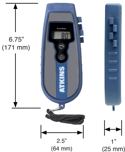
32311-K Thermocouple Instrument