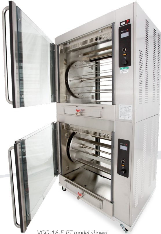
VGG-16-F-PT model shown

Ideal for extremely high-volume supermarkets and restaurants, the BKI® VGG-16-C has a massive cooking capacity that will meet growing customer demand and improve profitability. This rotisserie can cook up to up to 80 3-lb (1.36 kg) chickens in 75 minutes. The results are delicious—moist and tender inside and perfectly golden brown outside.