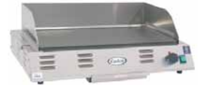
CG-10 120 volts/1500 watts/12.5 amps NEMA 5-15P Plug