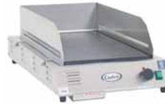
CG-5FB (Space Saver Front to Back Configuration) 120 volts/1500 watts/12.5 amps NEMA 5-15P Plug