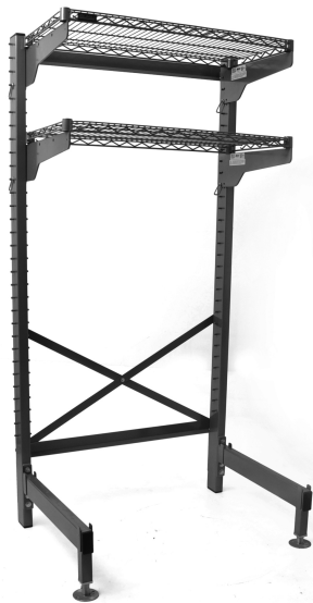
Overhead Storage Station

Uprights feature Valu-Master® gray epoxy. Shelves offered with Valu-Master® gray or Valu-Gard® green epoxy finish.