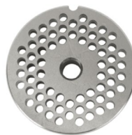
Grinder Plate 3/16" 4.5mm