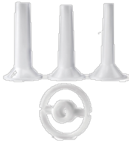
Sausage Stuffing Kit Size: 5/8", 3/4", 1" (15/20/25 mm)