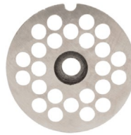
Grinder Plate 3/16" 4.5mm