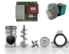
For parts www.ampto.com