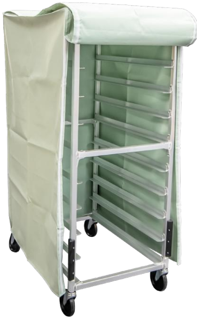
shown with optional Staph-Check® cover (#0351)