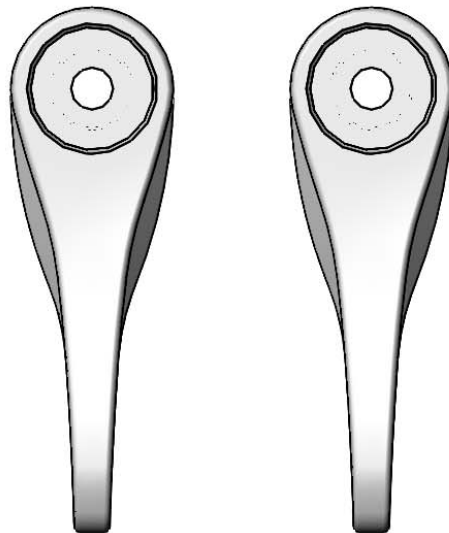
001638-45NS-AM Anti-Microbial Coated Lever Handle (2) Supplied

Product Specifications: Anti-Microbial Coated Lever Handle Parts Kit