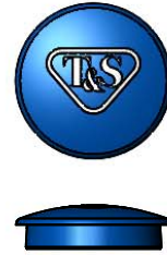
018506-19NS Blue Handle Index (1) Supplied