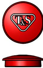
001193-19NS Red Handle Index (1) Supplied