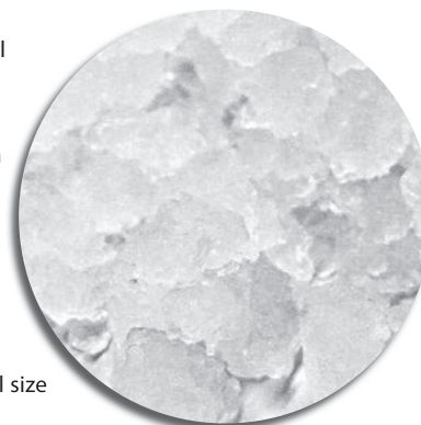
Ice shown actual size

Flake ice is small hard bits of ice ideally suited for presentation applications.