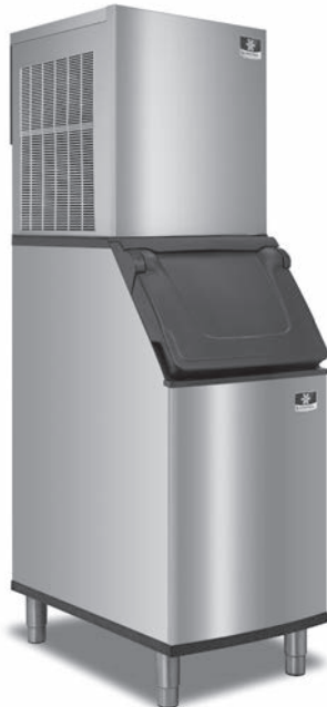
Model RFP0620A Flake Ice Machine on D-420 Bin