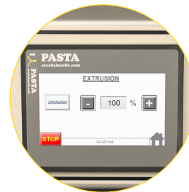
VARIABLE MIXING + EXTRUDING SPEEDS