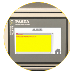
ALARMS INDICATING ERRORS