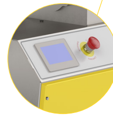
TOUCH SCREEN CONTROL