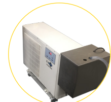
OPTIONAL WATER CHILLER MOBILE SYSTEM No plumbing required!