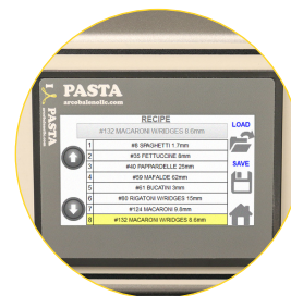
PRE-SET PASTA SHAPE RECIPES