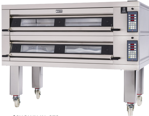
*SHOWN IN 3T2