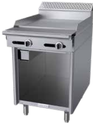
Model C24-1S 24" Add-A-Unit Griddle