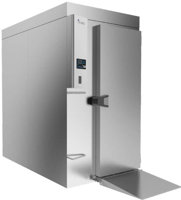
Note: Shown With Optional Ramp