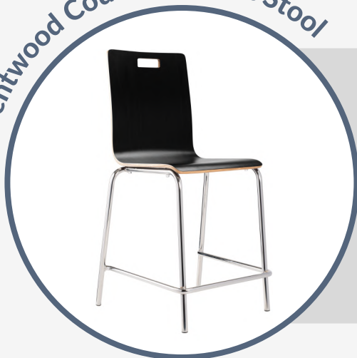
Bentwood Counter Height Stool