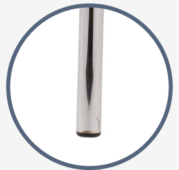
Durable Non-Marring Polypropylene Glides