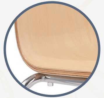
1/2" Thick 8-Layer Bent Plywood Seat With HPL Finish