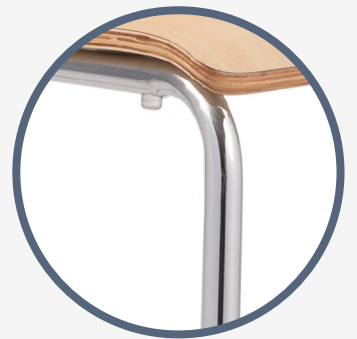
Stackable Design with Durable 7/8" 16-Gauge Chromed Steel Legs