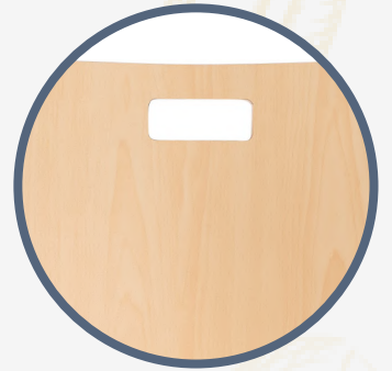
Sleek Handle for Effortless Movement and Convenient Storage

Step Up Your Style with Our Bushwick Bentwood Chairs and Stools!