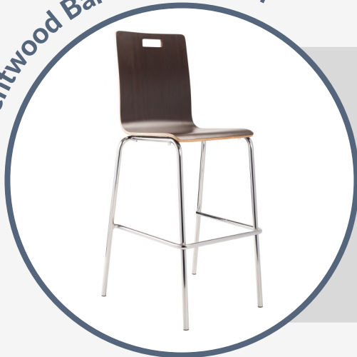
Bentwood Bar Height Stool