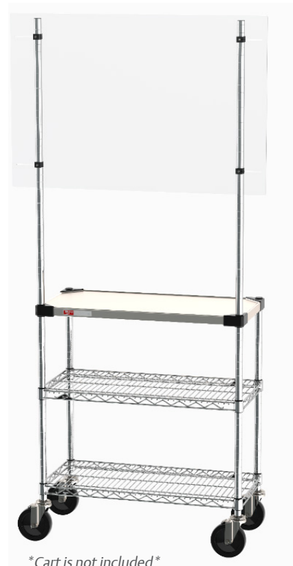
*Cart is not included*