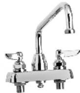
#313299 T&S faucet for 2200 Series underbar