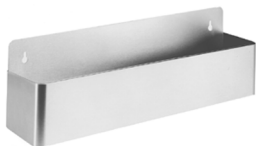
single-tier speed rail