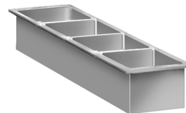
bottle holder tray