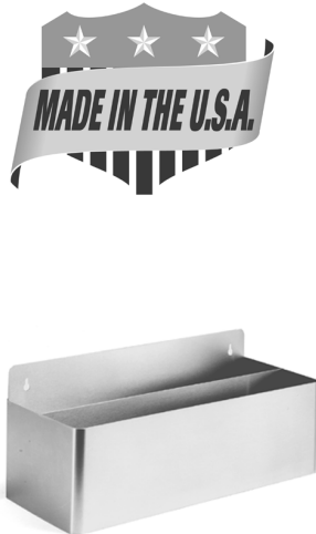
double-tier speed rail