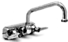
#313302 T&S faucet for 1800 Series underbar