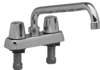
#300490 standard faucet for 2200 Series underbar