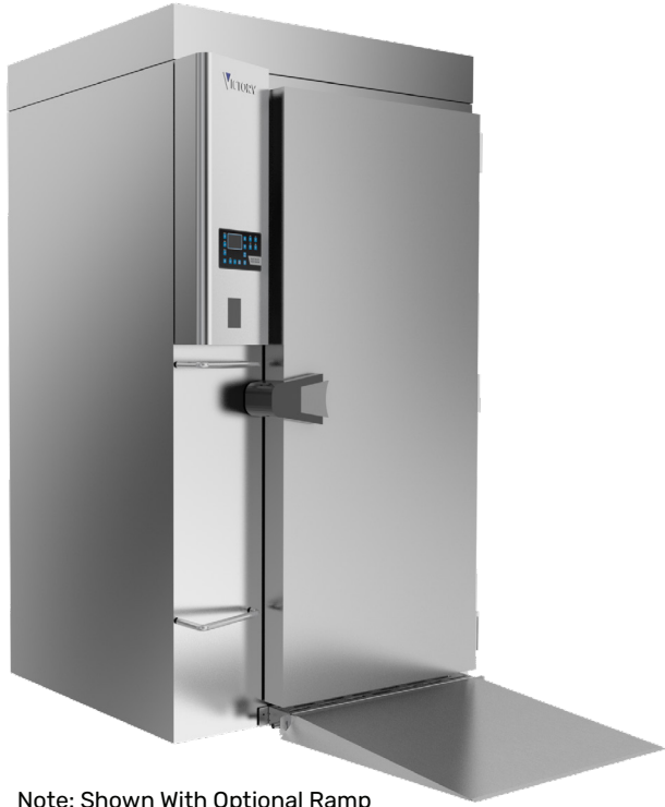
Note: Shown With Optional Ramp