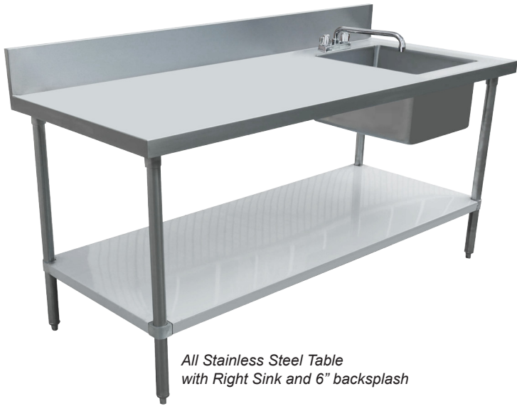
All Stainless Steel Table with Right Sink and 6" backsplash