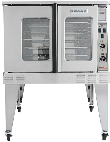
Model MCO-ES-10-S Shown with optional casters