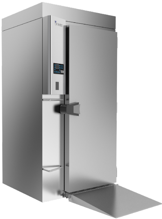
Note: Shown With Optional Ramp