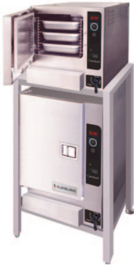
Shown with optional Cafeteria Pans