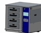
IS-4000 4-DRAWER STEAMER