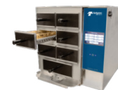
IS-7000 7-DRAWER STEAMER