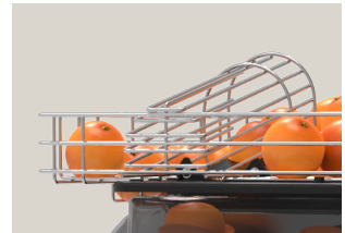
Standard contact sensor

The machine automatically starts up when the Contact sensor, included as standard equipment, detects the oranges on the ramp. It will also stop automatically when there are no oranges on the ramp, at which time the juicer goes into standby mode.