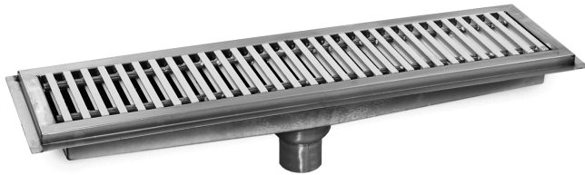
anti-splash floor trough with fiberglass grating

Eagle Anti-Splash Floor Trough with fiberglass grating, model _____ . Unit constructed of 14/304 stainless steel all-welded construction. Patented anti-splash design (patent #D519,618 S) assures complete drainage while preventing splash back onto the floor. Drain accommodates up to a 4"-diameter pipe and comes standard with a stainless steel removable perforated basket. Fiberglass grating to be 1" high yellow polyester material with a non-slip grit surface. Tapered "I" beam construction for ease of cleaning and drainage. Gray color grating available.