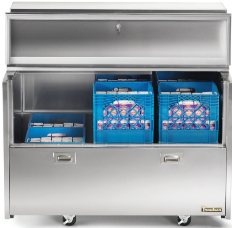
Model Shown - RMC49D4