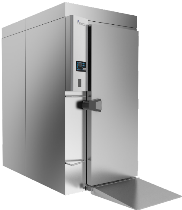
Note: Shown With Optional Ramp