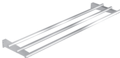
3 Bar Tray Slide