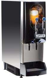
NITRON, 120V NITRON-2 W/RGD & NGM