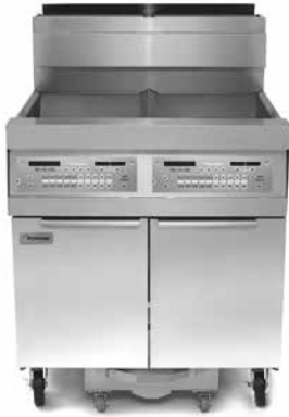
SCFHD250G Shown with optional 3000 controllers.