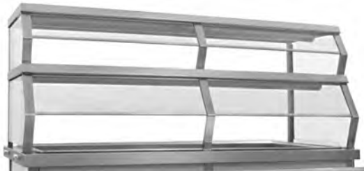
double tier sneeze guard