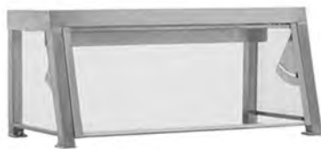
tilt/adjustable sneeze guard