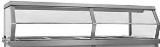
single tier sneeze guard

* See charts for complete model numbers.