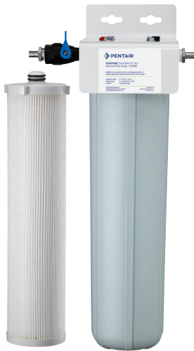
Endurance TKO MicroFilter Pretreatment System: EV9437-50

HIGH CAPACITY PRETREATMENT SYSTEM FOR FOODSERVICE APPLICATIONS