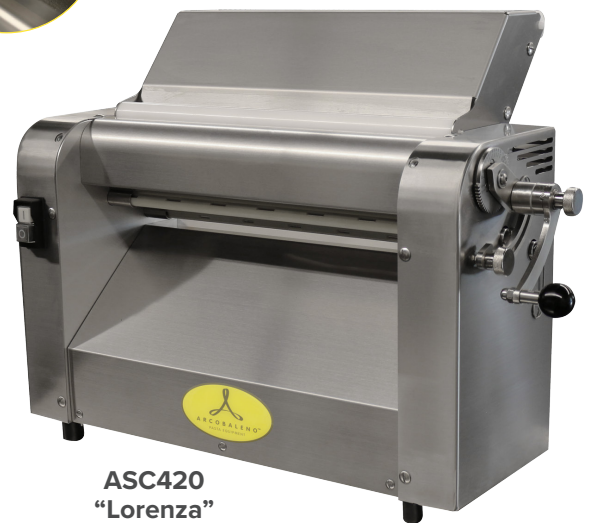
ASC420 "Lorenza" 16.5" dough sheet width