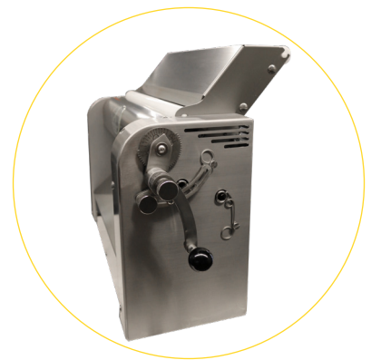
ERGONOMIC ULTRA COMPACT DESIGN

CAD file available on KCL or contact factory 717-394-1402. | Specifications subject to change without notice | © Copyright 2024 Arcobaleno® Pasta Machines, LLC