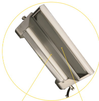
2 PASS SHEETER FRONT DOUGH FEEDER OPENING 3/8" BACK DOUGH FEEDER OPENING 1.5"