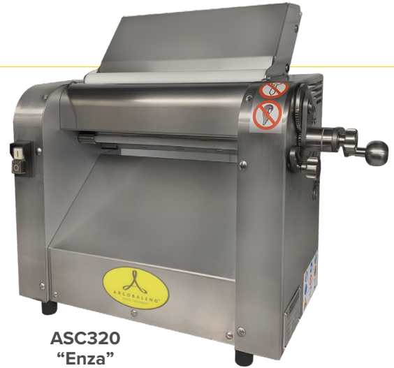
ASC320 "Enza" 12.5" dough sheet width