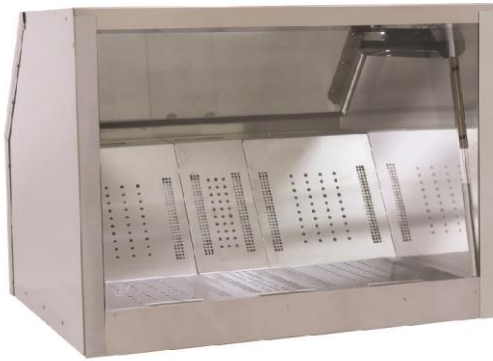
Customer Side (General image shown for reference only.)