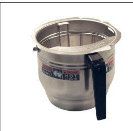
FUNNEL AY,W/DECAL GRT "C"7.12