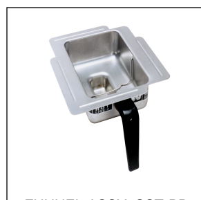
FUNNEL ASSY, SST-PP BLK HNDL