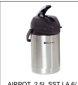
AIRPOT, 2.5L SST LA 6/ CASE