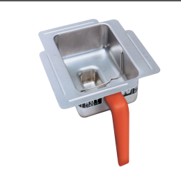
FUNNEL ASSY,SST-PP ORANGE HDL