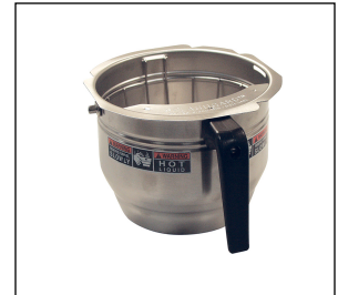
FUNNEL AY,W/DECAL GRT "C"7.62