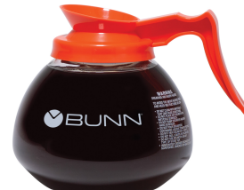
DECANTER, GLASS-ORN 12C 24/CS