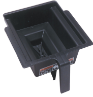
FUNNEL W/DECAL,PPK NAR BLK(LG)