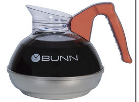
EASY POUR®,(ORN) 24/ CS