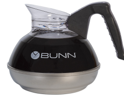
EASY POUR®,(BLK) 6/CS