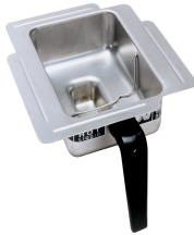
FUNNEL ASSY, SST-PP BLK HDL