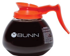
DECANTER, GLASS-ORN 12C 3/CS