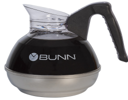
EASY POUR®,(BLK) 2/CS