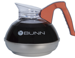
EASY POUR®,(ORN) 3/ CS