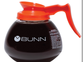
DECANTER, GLASS- ORN 12 CUP 1PK