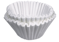
FILTERS,REGULAR1M 500/2 50/CL