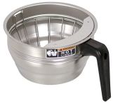
FUNNEL ASSY, SST-BLK HDL(7.12)