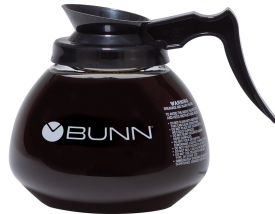
DECANTER, GLASS-BLK 12CUP 1PK