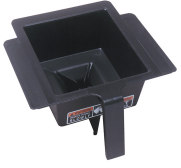
FUNNEL W/DECAL,PPK NAR BLK(SM)