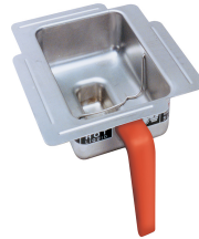
FUNNEL ASSY, SST-PP ORANGE HDL