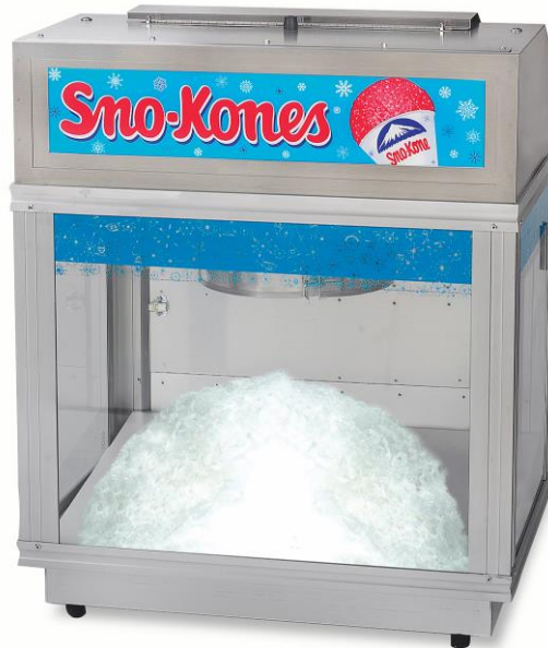
General image shown for reference only.