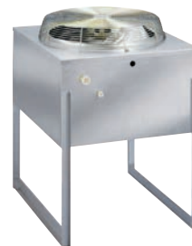
Standard air-cooled remote JCF 0900-261

Ice storage bin and JCF0900-261 remote condenser must be ordered separately. Consult remote condenser specification sheet for details. Tubing Kits come pre-charge with quick connects. When ordering, add an "A" suffix to the end of the electrical option. Example IDF0600N-261A