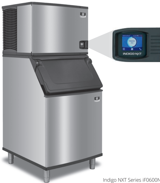
Indigo NXT Series iF0600N Ice Machine on a D570 Bin