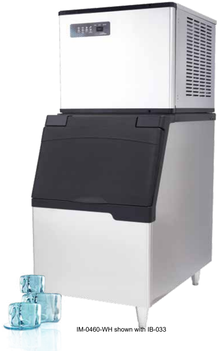
IM-0460-WH shown with IB-033