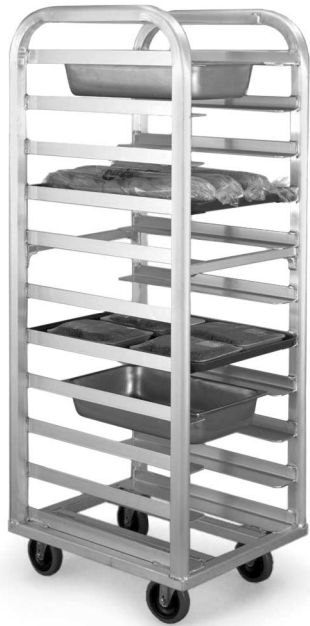
LIFETIME Series universal roll-in rack

Eagle LIFETIME Series Universal Roll-In Rack, model _____ . Constructed of heavy duty 6063-T5 aluminum alloy. Fully welded frame. 1" square tubular crossbracing. Base consists of 1½" x 1½" square aluminum tubing with pretapped caster plates welded inside. ¾" wide angle slides welded to uprights. Heavy duty 5" x 1½" non-marking swivel casters.