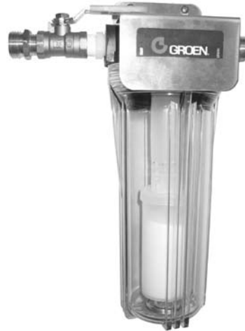
Model SSB-WT shown

Treatment system and replaceable cartridges shall be made in the United States.