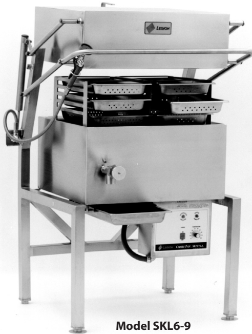
Model SKL6-9 (with optional food pans)