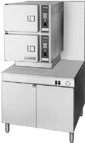
Shown with optional Electronic Timer