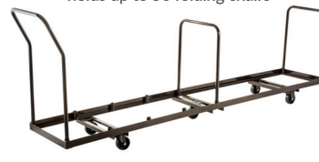
Folding Chair Dolly DY35/DY50 holds up to 50 folding chairs