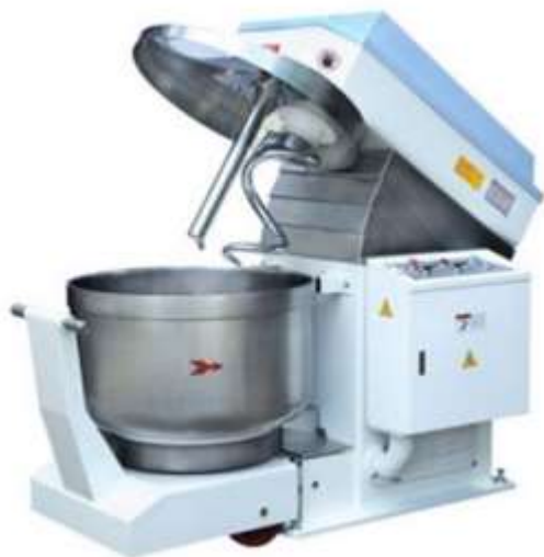
Mixing Head Raised View

** Due to continuous product improvement, specifications are subject to change without notice.