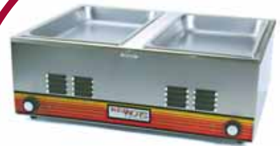
two-well food warmer with 12" x 20" heat well openings, shown with optional food pans