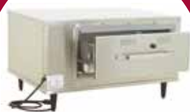
pass-thru heated drawer

Ideal for crisp or moist foods. Available in 1-, 2-, and 3-drawer units, freestanding or built-in, wide or narrow width. Heavy duty stainless steel construction with fiberglass insulation.