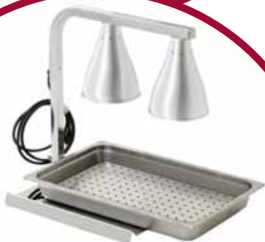
bulb warmer with drain insert and pan