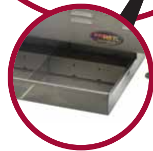
water pan open, showing baffles inside