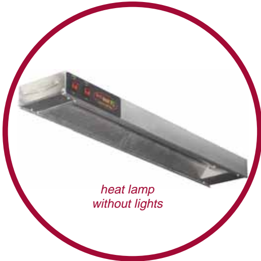
heat lamp without lights

Standard- and high-watt units offered. Available with built-in On/Off switch or with remote infinite switch. Units 18"- to 108"-long available in 120V, 208V, or 240V voltage. 120"- to 144"-long units available in 208V or 240V only.