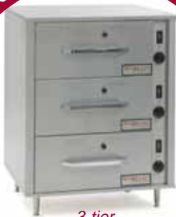
3-tier freestanding unit