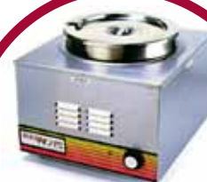
cooker/warmer shown with optional round inset with lid