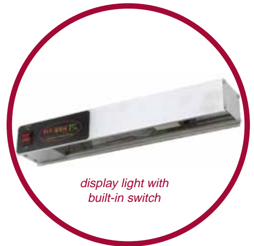
display light with built-in switch