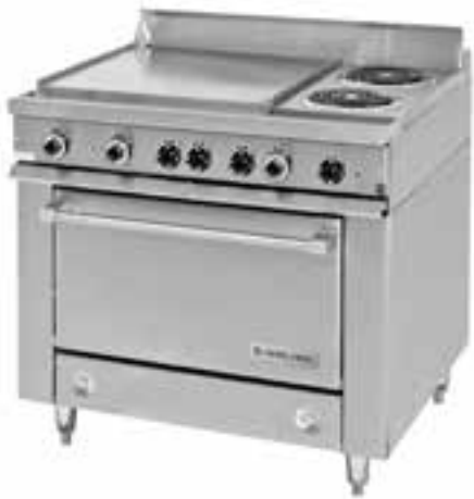
Model 36ER32-3 Combination All Purpose Plate And Open Element Top Range