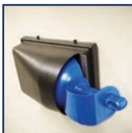
Horizontal left entry wall mount

Optional hanger K00482 is required if using with F-Bins or LB-Style Bins.