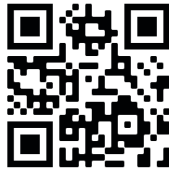
(Wall Mount Video QR)

The multi-mount external scoop holder improves overall sanitation. With the addition of the holder, it makes daily operations much quicker and easier. Keep your scoop protected and never lose your scoop AGAIN!