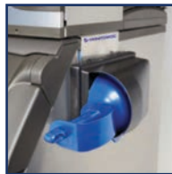
Horizontal right entry bin mount