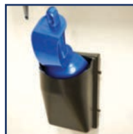
Vertical wall mount