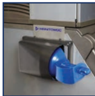
Horizontal left entry bin mount