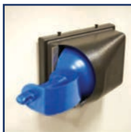
Horizontal right entry wall mount