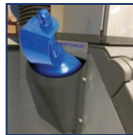
Vertical left side bin mount