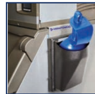
Vertical right side bin mount

For Maniowoc F bins or LB-Style Bins: order Hanger K00482 kit along with K00461